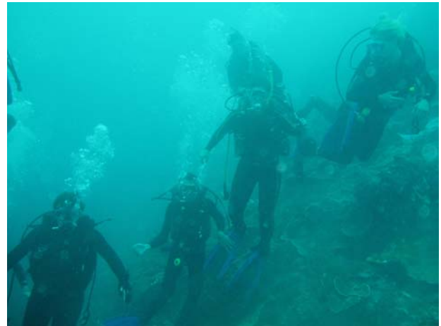
Finishing Open Water and Advance diving Certification.

Him. People are exciting to see how the Lord is working in lives of our children and those who don't know the Lord personally. The children are able to share how God has