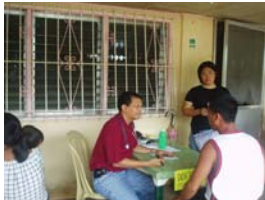
Physicians hard at work for the Lord