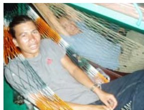
Hammocks make the sleep much better on the boat.

Praise the Lord that the rebuilding and relocation of families has begun in 5 of the 7 Barangays which were affected by the slide. About 100 families transferred into homes the end of May to first part of June.