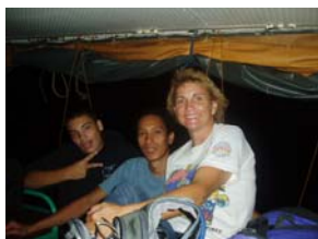
Friends make the journey more fun & work light.