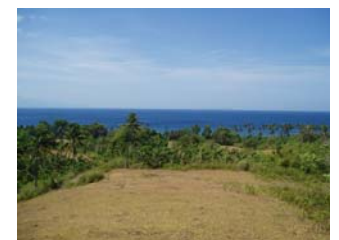
The first step for the Creator's Critters Adventures Center