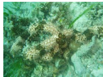
Some beautiful Stars crawl.