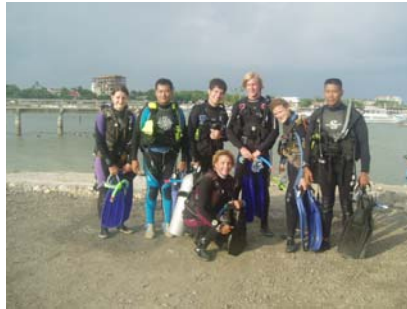
International training helps prepare interns for language and culture.