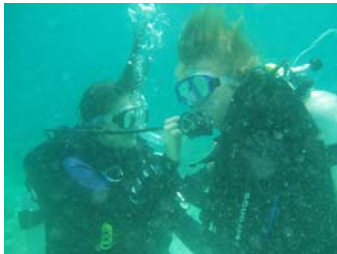
Skills that help you help your Buddy and dive safely.

As the dive training continues at Christ For Asia, we are able not only to introduce diving to Interns but also some of the local foods during breaks and surface intervals and local Filipinos and their culture. They are willing to learn and Filipinos are happy to assist them in their learning experiences.