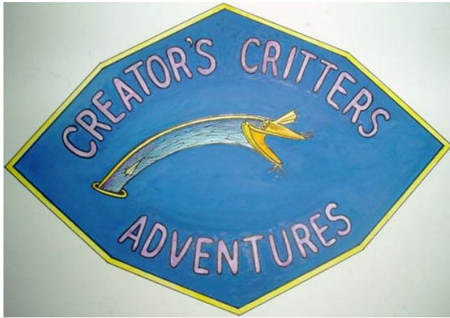
Logo and Mascot