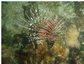
Beauty can be Dangerous! Lion Fish