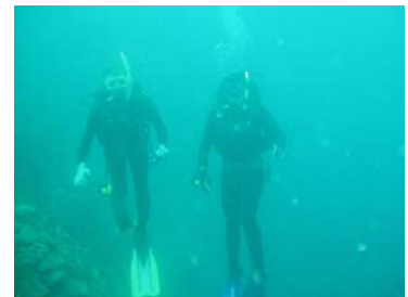
Hovering is one of the most important skills.

There are many things God has created under the water to enjoy. Some are fun, some beautiful yet deadly, and some are crawly beauties. Everyone wonders about experiencing the beauty down under there and God has provided a way not only for fun but learning as well as livelihood for our children. Those who may be too young still get to enjoy the educational pictures and stories shared by those who dive.